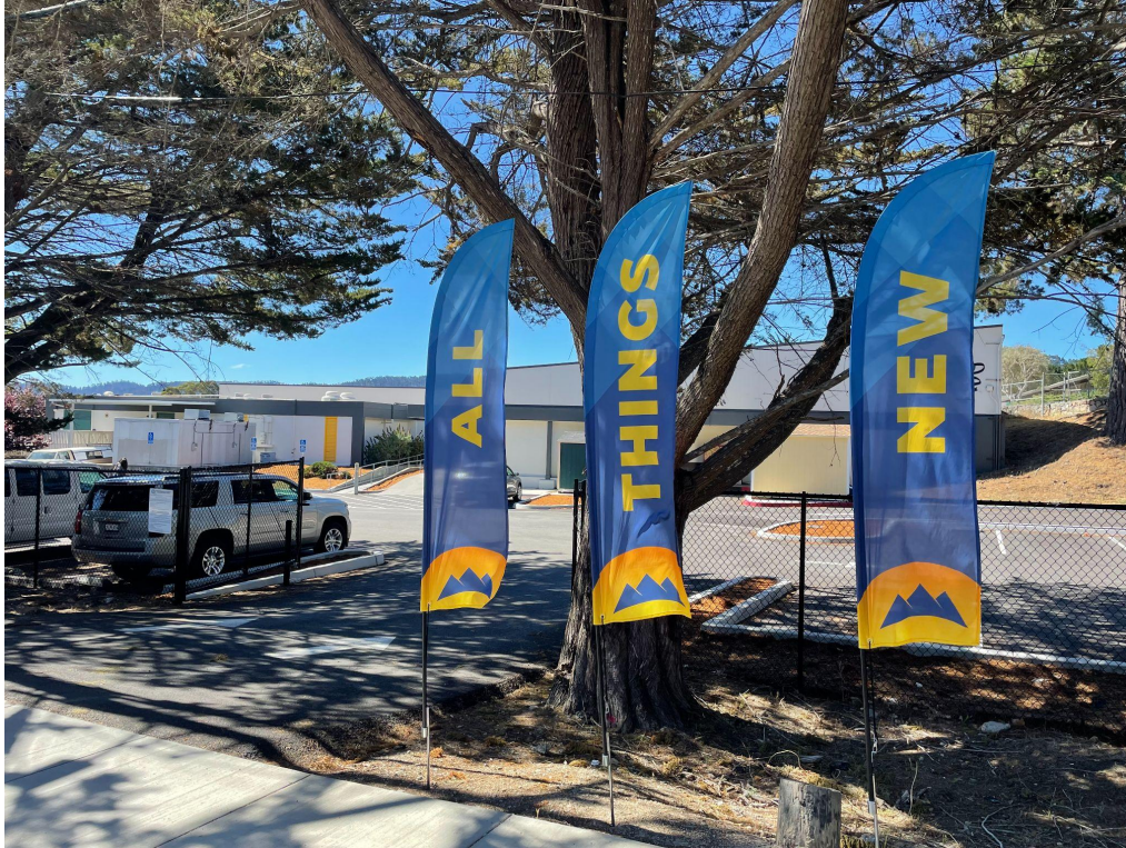
All Things New Banner outside the cafeteria